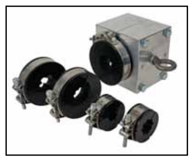
The Thrust Block option also available.

See our Thrust Block brochure for more information.