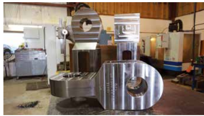
Chase block and pins.

"Northern Strands has a suspended access division, which is like our limousine service," explains Clarke. "It gets you to where you want to go, whether it's to the top of a building, down in a mine shaft, or underneath a bridge. Where you need to get to, we provide the access to that, as well as providing the training if you want to do it on your own."