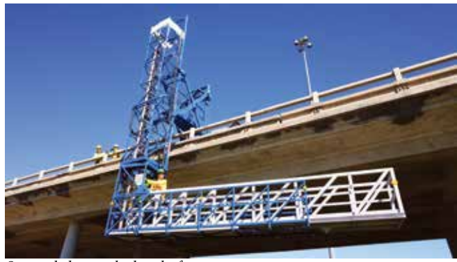
Suspended access hydra platform.